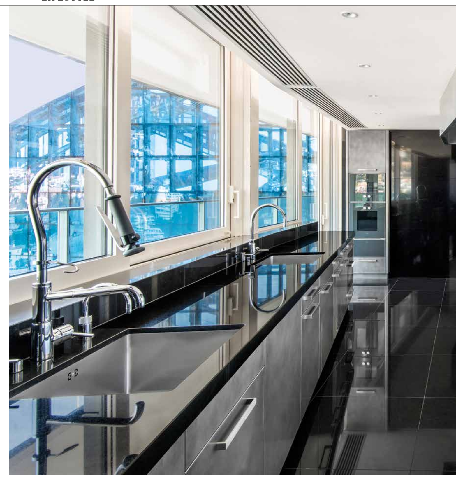
From the heart of the Swiss Alps in the penthouse of 'Tour Odéon' in Monaco

The kitchen in the most expensive penthouse of the world bears the signature of Zbären